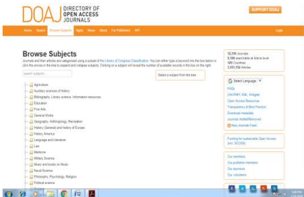
Fig.4 Directory of Open Access Journals