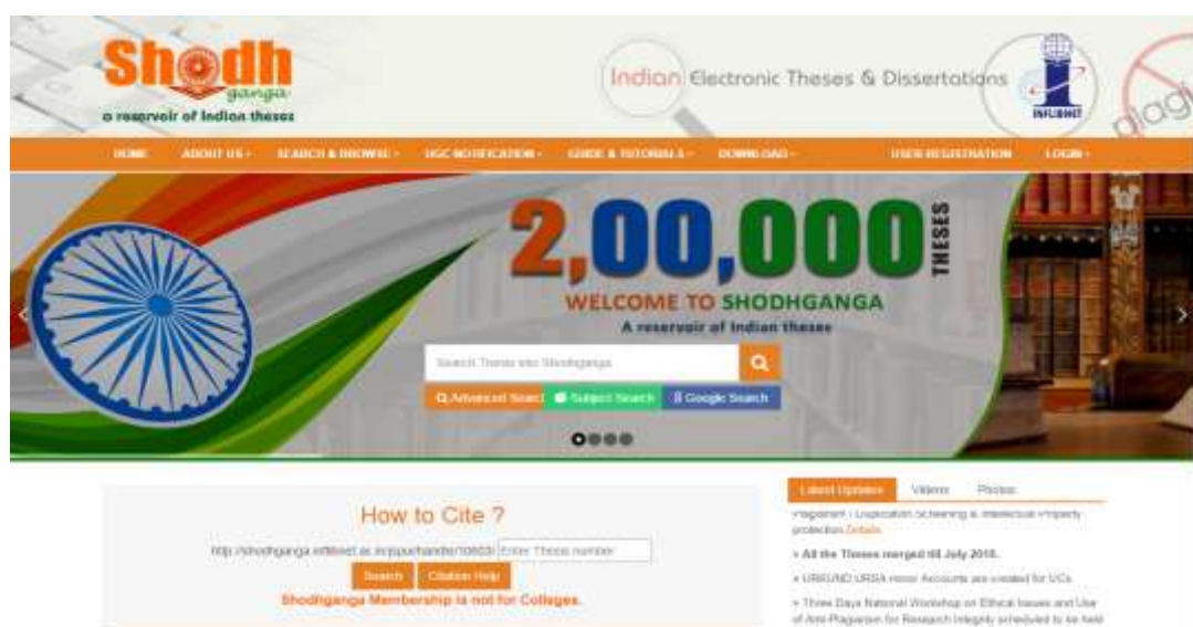
Fig.2. http://shodhganga.inflibnet.ac.in/ (Shodhganga Homepage)

Shodhganga is a reservoir of Indian Theses. Theses and dissertations are known to be the rich and unique source of information, often the only source of research work that does not find its way into various publication channels. Theses and dissertations remain an un-tapped and under-utilized asset, leading to unnecessary duplication and repetition that, in effect, is the anti-theses of research and wastage of huge resources, both human and financial. Shodhganga portal provides more than 2 lakh full text thesis. It is highly useful for the research scholars.